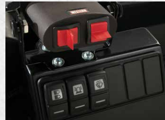
DASH-MOUNTED CONTROL CONFIGURATION

Full-hydraulic operation allows the operator to position the plow left, right, up, down, or float from inside the cab. This hydraulic system has been specifically designed to operate on mid-duty UTV plows, minimizing amperage draw and weight for seamless operation.