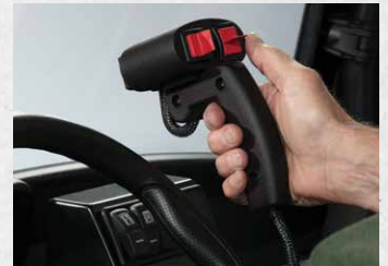
HAND-HELD CONTROL CONFIGURATION